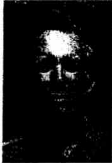
(U) William Pierce

Most information about systematic attempts by white supremacist groups to infiltrate law enforcement involve: [redacted]